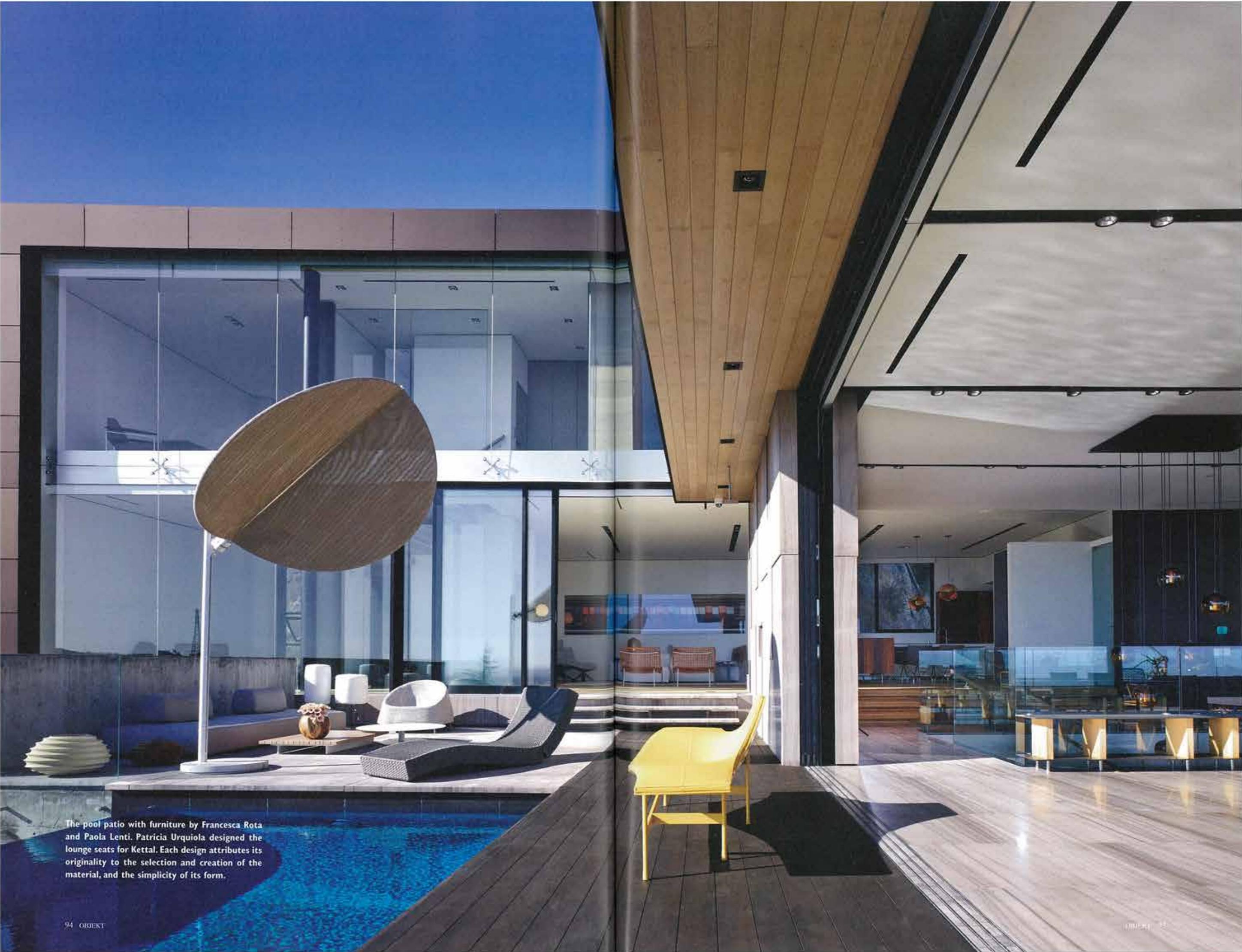
The pool patio with furniture by Francesca Rota and Paola Lenti. Patricia Urquiola designed the lounge seats for Kettal. Each design attributes its originality to the selection and creation of the material, and the simplicity of its form.