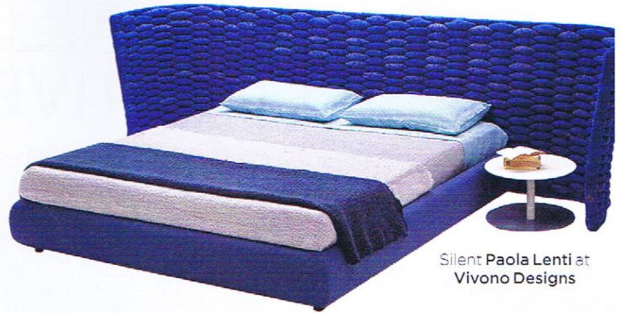
Silent Paola Lenti at Vivono Designs