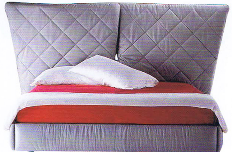
Lelit Poltrona Frau at Poltrona Frau Design Center