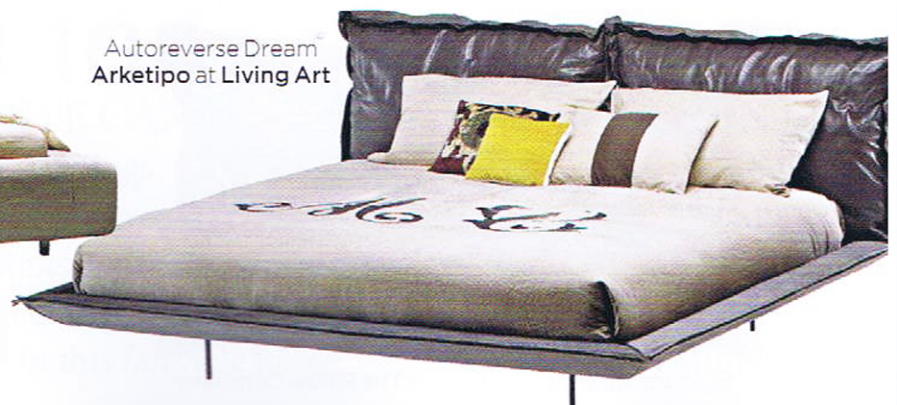
Autoreverse Dream Arketipo at Living Art