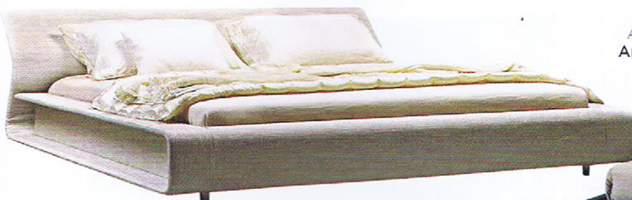
Clip Molteni at Étreluxe