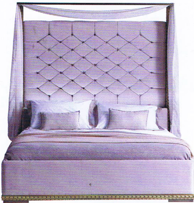
Fabula Angelo Cappellini