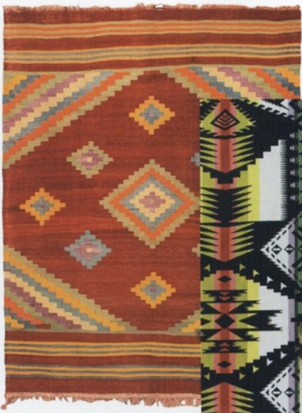
VINTAGE KILIM; $6,500. WOVEN.IS