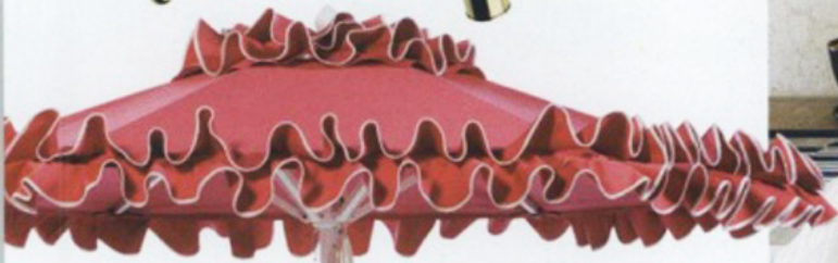
PETITE FLAMENCO UMBRELLA; TO THE TRADE. SANTABARBARADESIGNS.COM