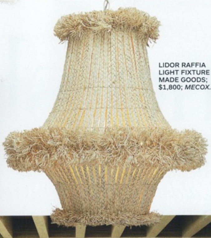
LIDOR RAFFIA LIGHT FIXTURE BY MADE GOODS; $1,800; MECOX.COM