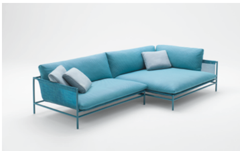
Canvas , design Francesco Rota

First introduced in 2009, Canvas is an outdoor sectional sofa with a timeless design. Paola Lenti proposes it today in a refreshed version featuring Maris fabric as structural element, thanks to its tenacity and weight-bearing capacity, to support the seat and back cushions. The wide range of shades available can be coordinated with all the upholstery fabrics of the outdoor collection and with the glossy and matt varnishes of the steel structures, in an almost unlimited play of color combinations.