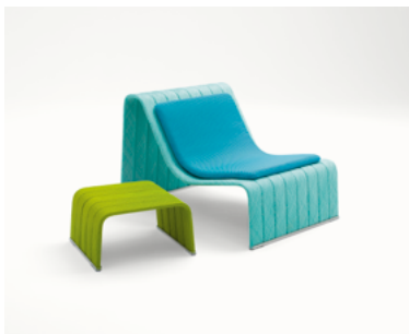
Frame , design Francesco Rota

A historical collection, consisting of sectional seatings, platforms, armchairs, chaise longues, chairs, benches and tables is renewed through the use of the new Twiggy yarn braids, which now cover the essential structures of the series, formed by profiles in aluminum, alongside the traditional braids in Rope and Aquatech yarns.