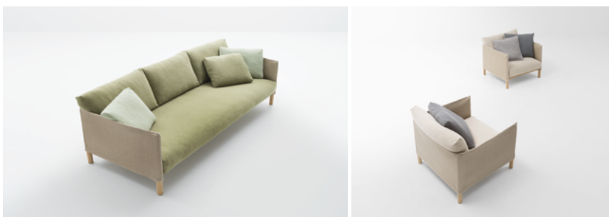
Vespucci , design Francesco Rota

Armchair, two- and three-seater sofa. The structure in steel and sassafras wood is covered with a structural upholstery in Spago, a fabric made by weaving a linen twine. This upholstery, that can be easily removed, contains the seat and back cushions, available with a natural padding – latex, paineira fibre and woolen felt – or synthetic, in recycled polyester fibre and polyurethane and covered in a range of linen or hemp fabrics.