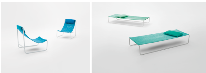
Hammock , design Rene Gonzalez Architects

Armchair and sunbed in varnished stainless steel, fixed cover in Maris fabric or, for the armchair only, consisting of a network formed by rings in Rope cord joined by hand. Armchair and sunbed can be made even more comfortable with headrests in polyurethane and recycled polyester fibre, covered in the outdoor fabrics of the collection in colors matching both those of the Maris fabric and the Rope cord, and those of the steel structures.