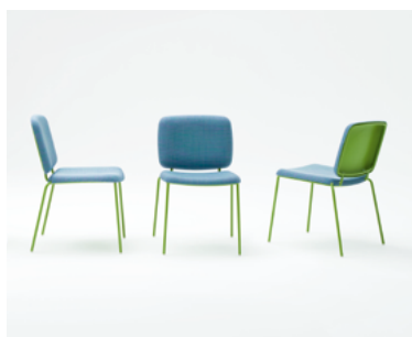
Nina , design Francesco Rota

Stackable chair composed of a stainless steel structure and weight-bearing molded panels in Diade, shaped so as to remind the traditional padded chairs: a timeless concept, updated in the details and materials that, combined with practicality and an elegance beyond temporary trends, makes Nina ideal for both contract and residential projects.