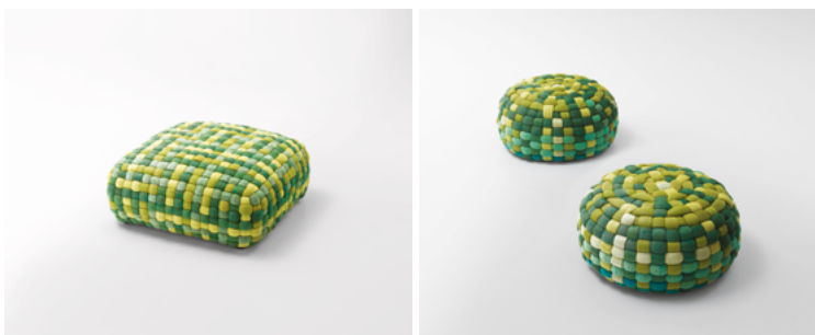
Tobit , design Paola Lenti CRS

Poufs with different dimensions and shapes. The padding in polypropylene microspheres is covered with a removable upholstery woven by hand with Chain Outdoor tubular knit, exclusive to Paola Lenti.