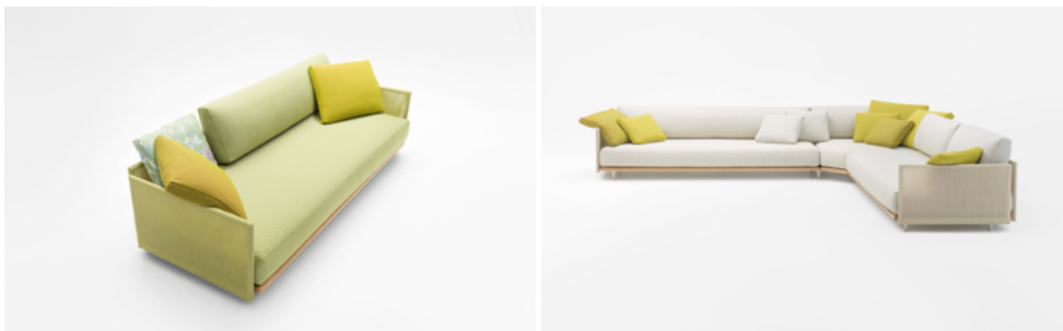
Harbour , design Francesco Rota

Armchair, sofa, sectional elements, chaise longue and pouf. The steel and sassafras wood frame is completed by panels in Maris fabric, acting as back and armrests. The cushions are largely made of Aerelle® blue, the fully recycled fibre that Paola Lenti has adopted to make the padding of both indoor and outdoor seatings in the collection sustainable. The cushions upholstery is removable and available in many outdoor collection fabrics.