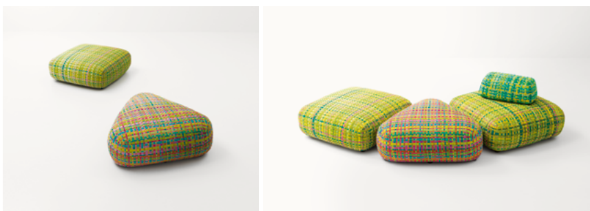
Millefiori , design Paola Lenti CRS

Pouf with steel structure padded with polyurethane and recycled polyester fibre. The removable upholstery cover is woven by hand with braids in Rope yarn in different colours. Millefiori poufs can be completed by independent backrests positioned as desired.