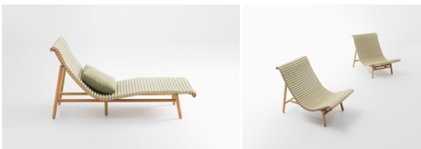
Shibusa , design Francesco Rota

Lounge chair and chaise longue. The structure in turned bamboo is combined with a seating area in igusa, a natural, resistant yet delicate material, which matures over time without losing its structural characteristics, changing colour from a light green to a straw yellow shade. The particular nature of this material leads the company to advise to use Shibusa seating exclusively in interior environments.