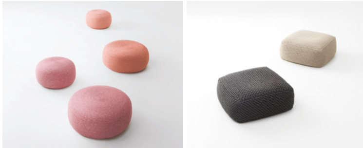
Otto, Picot , design Paola Lenti CRS

Pouf created by sewing in a spiral-like pattern (Otto) or crocheting (Picot) linen or hemp cords. The padding is available in natural materials – latex, paineira fibre and woolen felt – as well as synthetic – recycled polyester fibre and polyurethane or in polypropylene microspheres.