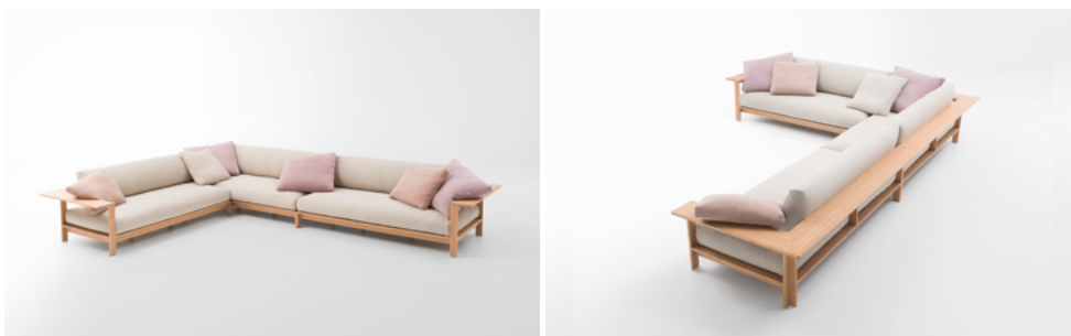
Frei , design Francesco Rota

Three-seater sofa and sectional seating elements. The structure made of bamboo panels encases seating and back cushions available with a natural padding – latex, paineira fibre and woolen felt – or synthetic, in recycled polyester fibre and polyurethane. The cushions feature a linen or hemp upholstery fabric.