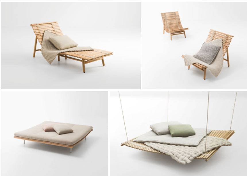
Shibui , design Francesco Rota

Lounge chair, chaise longue, suspended and freestanding platform. The structure of Shibui is made of turned bamboo, the seat and back are made of bamboo stick tied together with jute straps. The freestanding and the suspended platforms require a seat pad, available with a natural padding – latex, paineira fibre and woolen felt – or synthetic in recycled polyester fibre and polyurethane; upholstery cover in a range of linen or hemp fabrics.