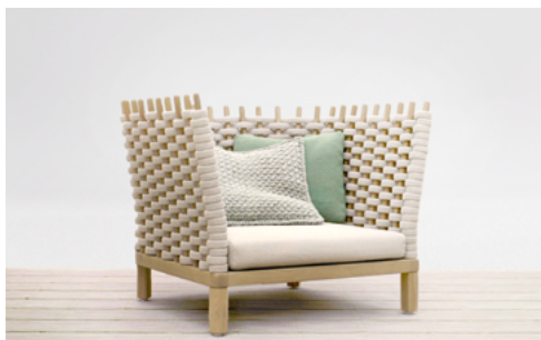
Wabi , design Francesco Rota

Armchair, sofa and lawn swing. The new version of a classic in the Paola Lenti outdoor collection combines the structure in sassafras wood with a fixed cover, which is woven by hand with a linen cord. The seat, back and loose cushions are available with a natural padding – latex, paineira fibre and woolen felt – or synthetic, in recycled polyester fibre and polyurethane and covered in a range of linen or hemp fabrics.