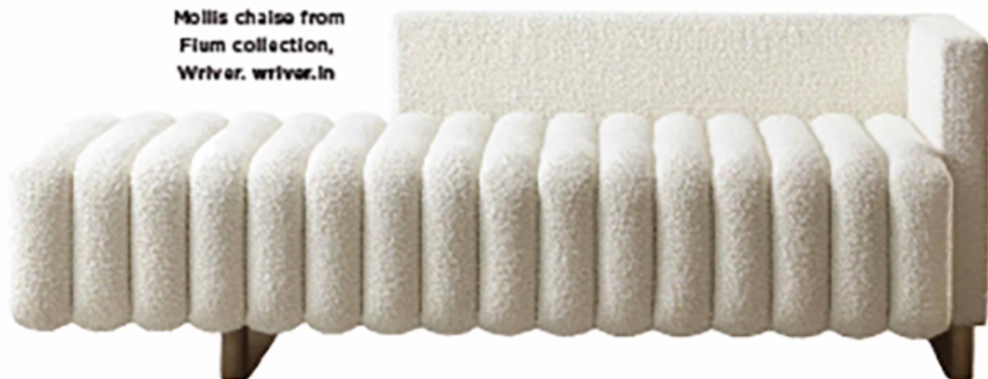
Mollis chaise from Fium collection, Wriver. wriver.in