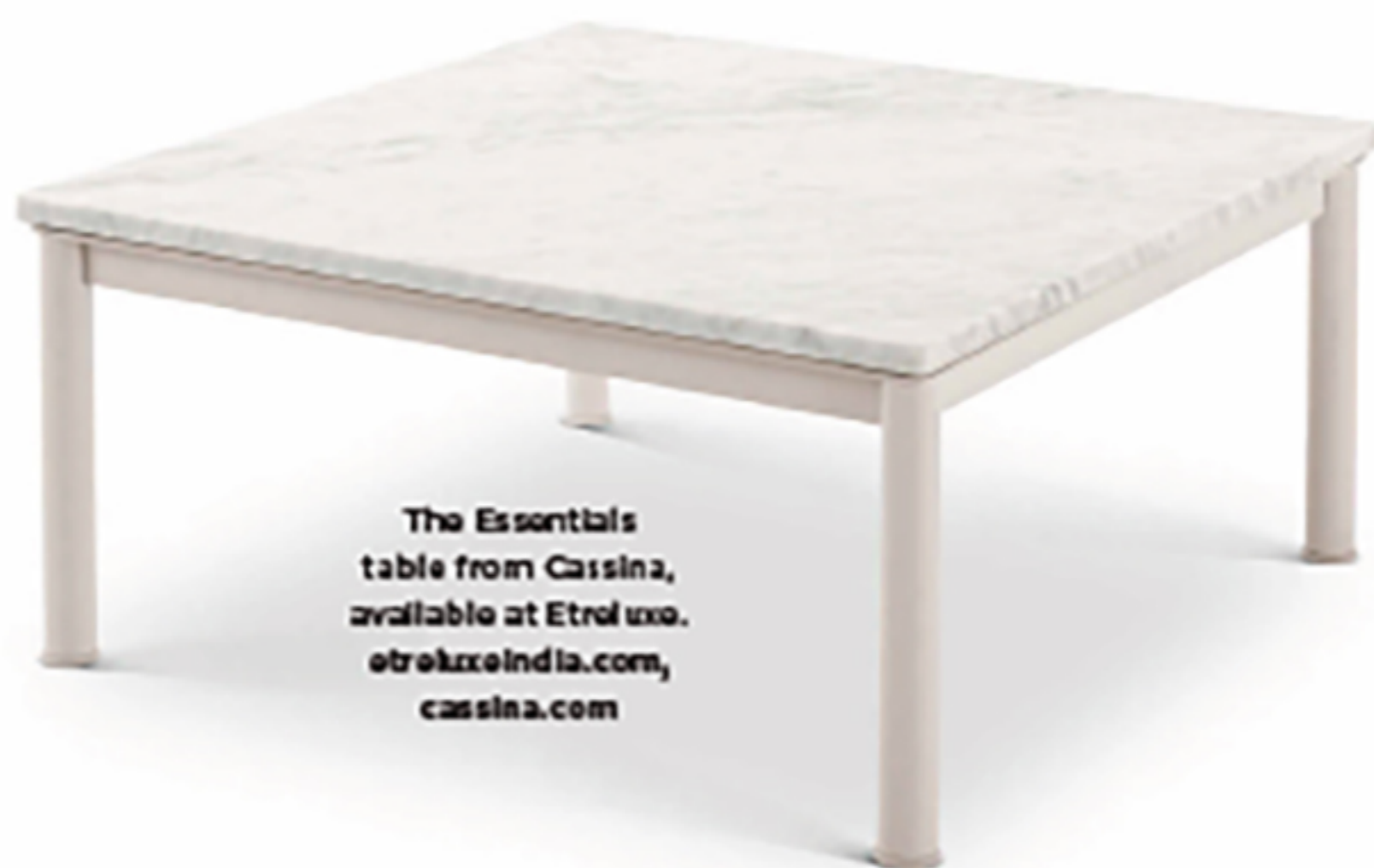
The Essentials table from Cassina, available at Etrusco. etruscoindia.com , cassina.com