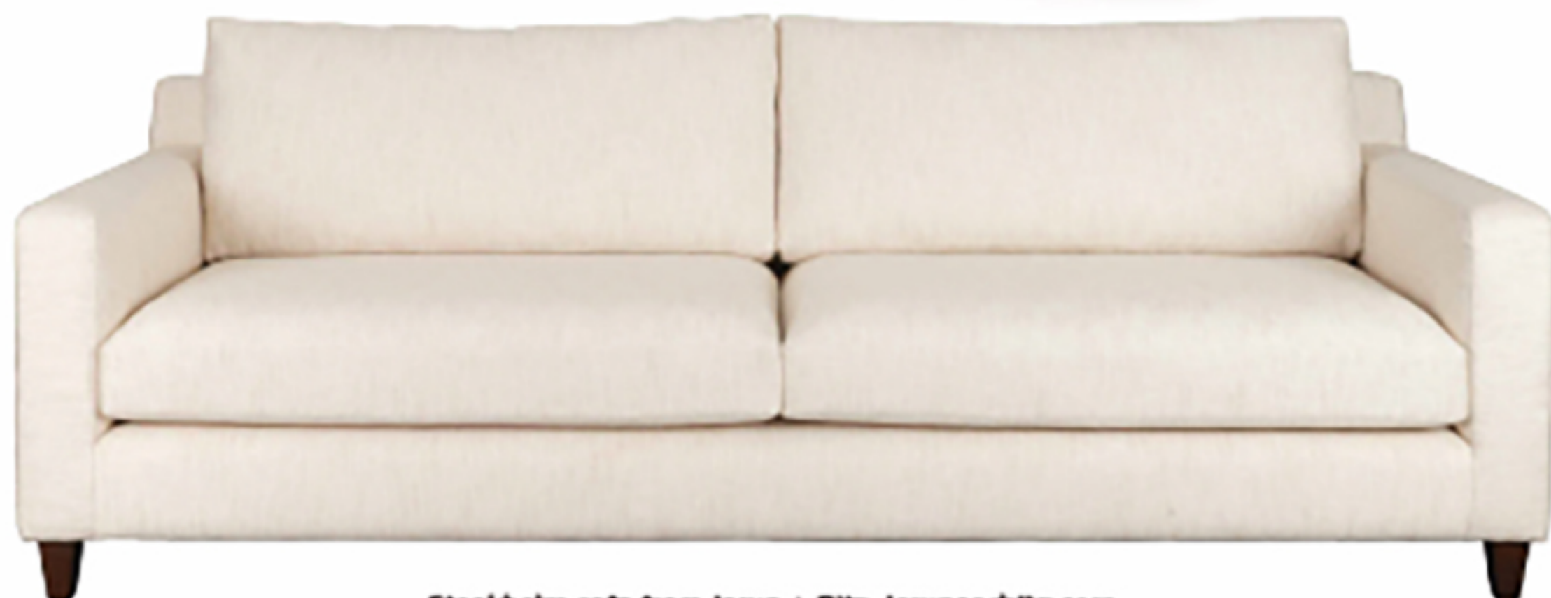
Stockholm sofa from Iqrup + Ritz. iqrupandritz.com