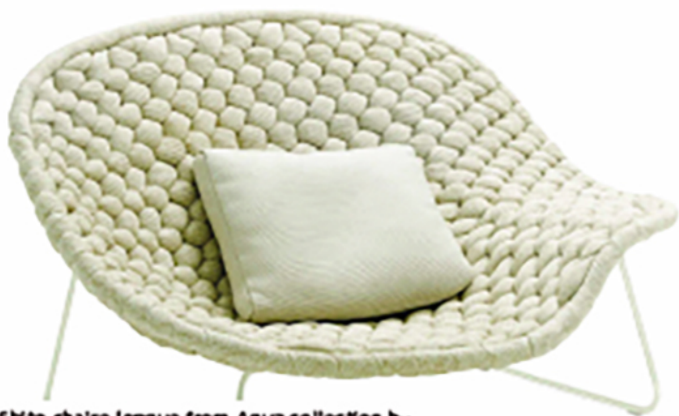
Shito chaise longue from Aqua collection by Francesco Rota, PAOLA LENTI srl, available at Vivono Designs. vivonodesigns.com , paolalenti.it