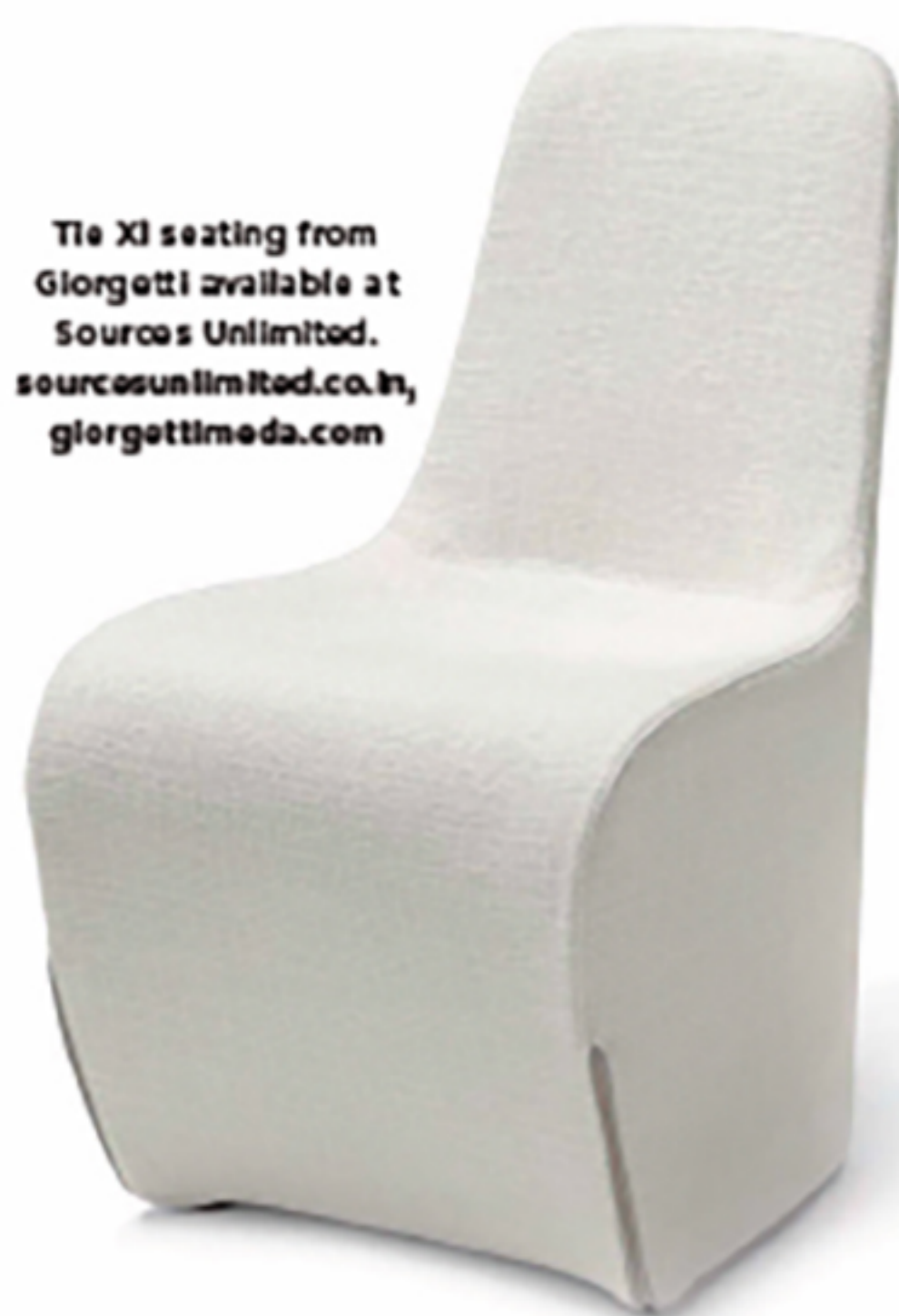
Tie XI seating from Giorgetti available at Sources Unlimited. sourcesunlimited.co.in , giorgettimeda.com