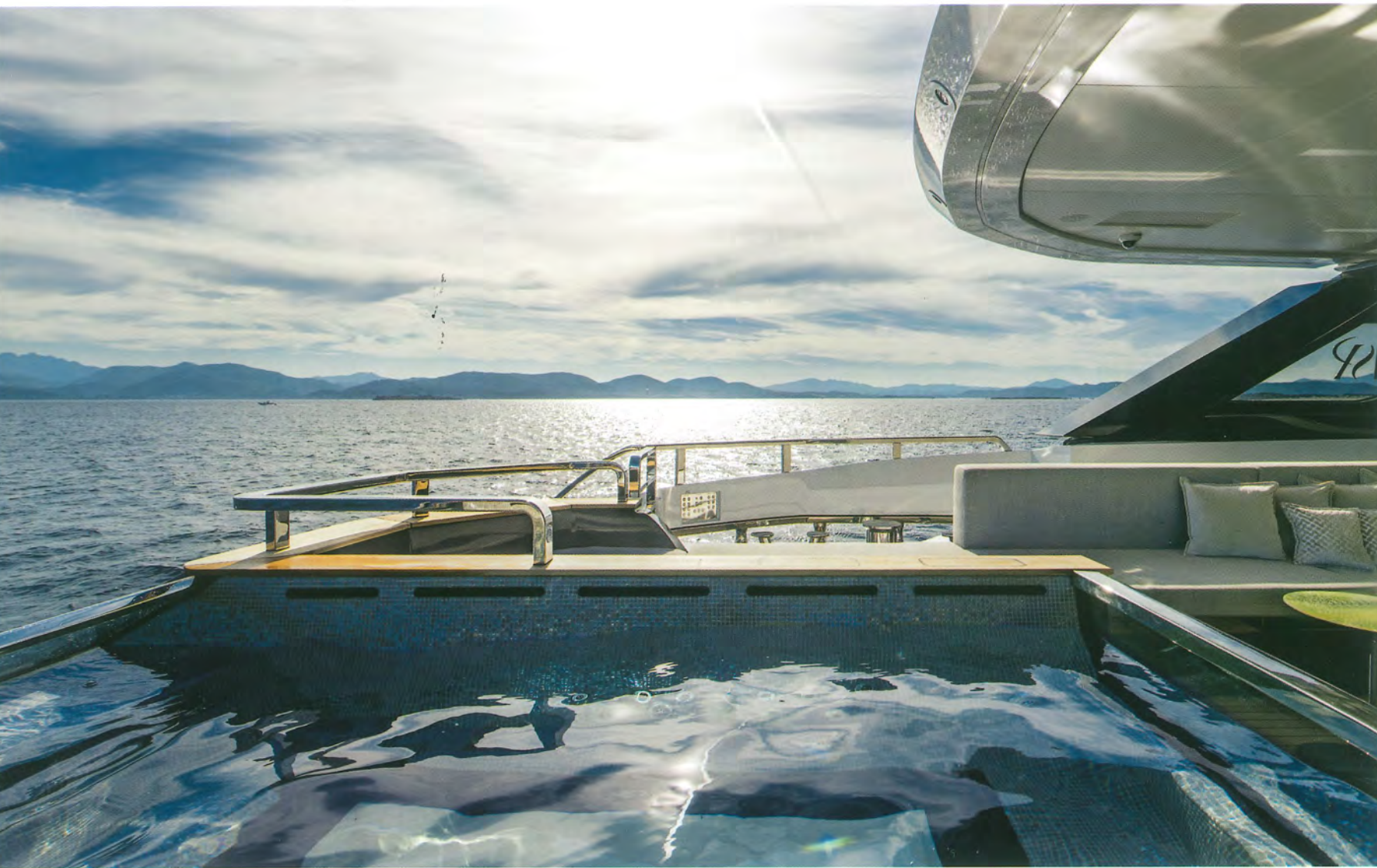
EXTERNAL AREAS ARE FUNDAMENTAL ASPECTS ON BOARD M/Y UV: (this page) the pool area on main deck