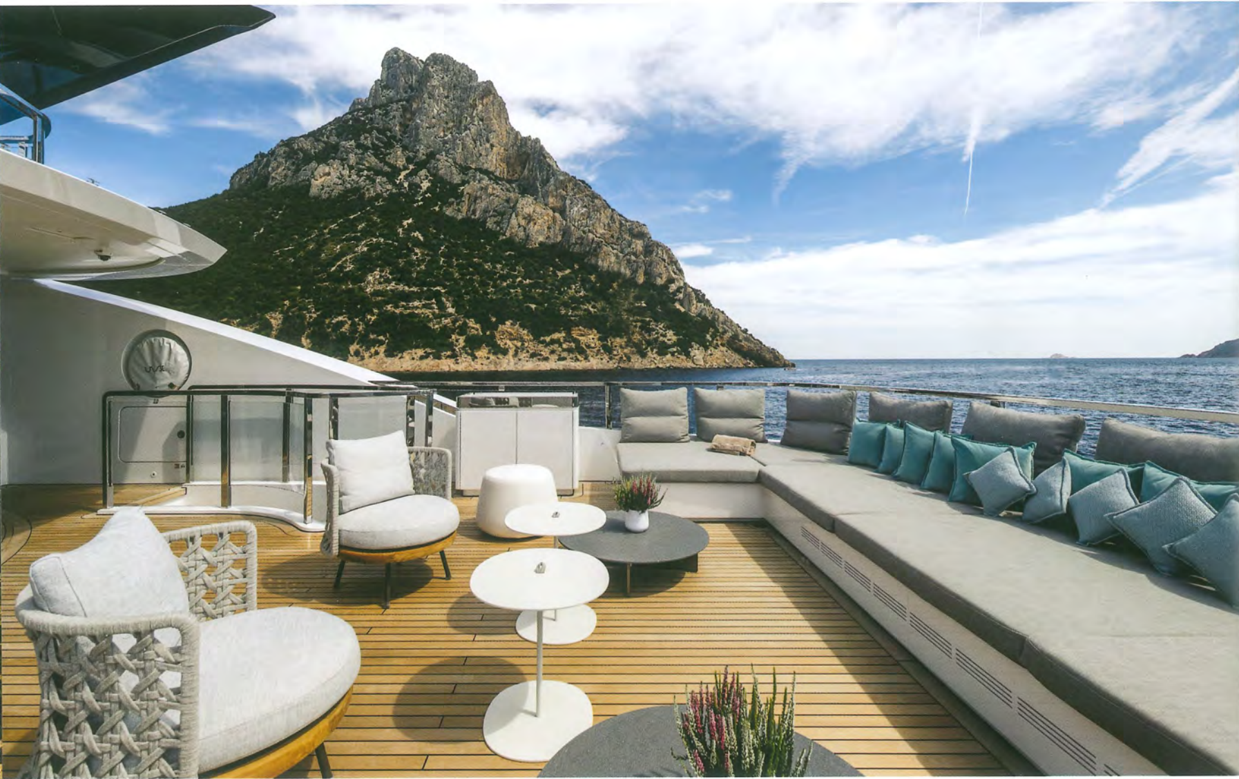
EXTERNAL AREA ON UPPER DECK: (below) BEACH AREA