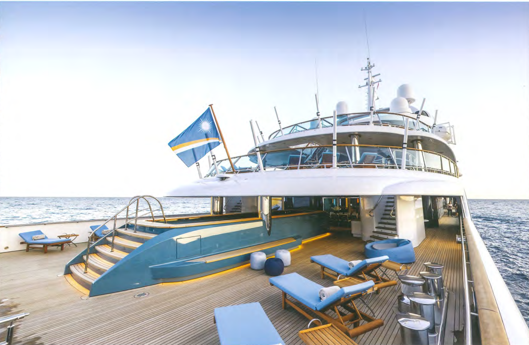
Opposite page: Sundeck (above); Staircase at upper deck aft (below) This page: Swimming pool at main deck

Bizzozero Cassina Architects led and supervised the interior and exterior design transformation, working in close collaboration with the owner's representatives from RYacht Management. The refit works mainly involved redesigning the external decks which now showcase a refined, comfortable and stylish lounge and living area.