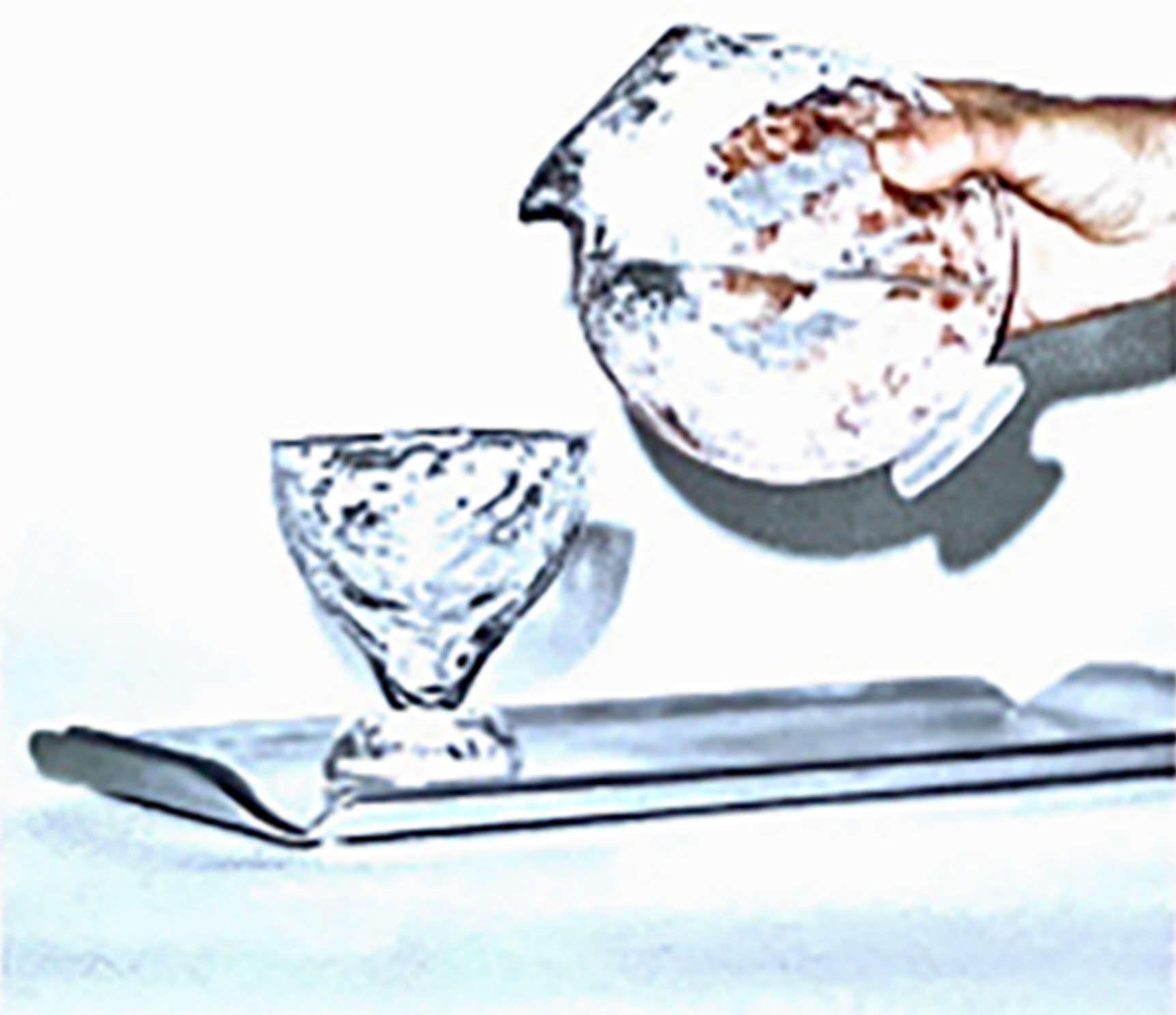
Table Light by Studio Haos

◀ The Mezza Forma pouring jug and goblet are hand-blown glass art objects with practical merit. Led by glassmaker Billy Crellin, Melbourne-based Studio Dokola creates tactile, contemporary vessels and tableware that celebrate experimental glassblowing processes and unexpected design outcomes, offering a departure from refined industrial glass. Mezza Forma pieces feature a mottled, uneven texture, as if carved from ice. A range of Mezza Forma vessels were included in this year's Cheers! group exhibition presented by Craft. Craft — shop.craft.org.au